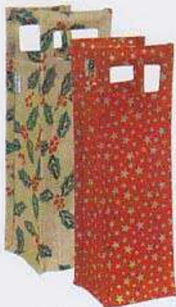
Style# 11033 Size: 15"x4.5"x4"