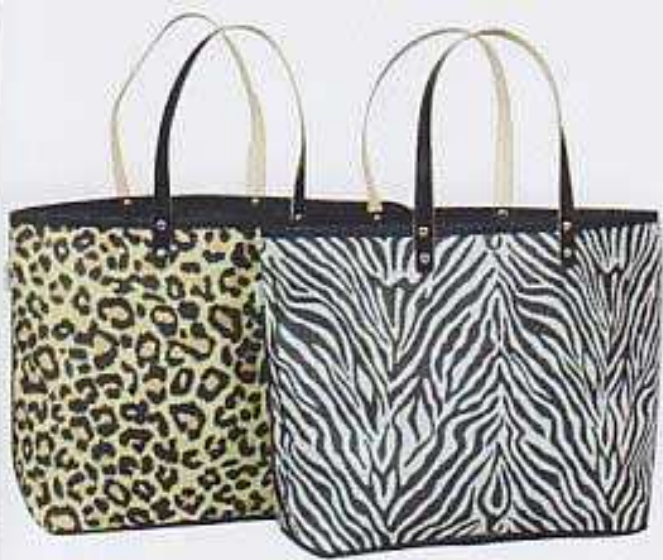
Style: 15126 Size: 13"x20"x6"D