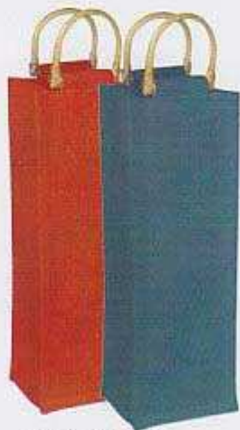
Style# 11002 Size: 14"x4"x4"