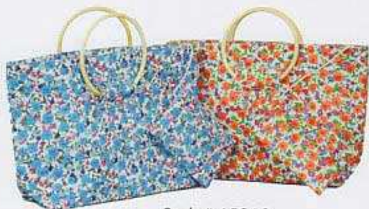
Style# 15310 Size: 12"x19"x5"D