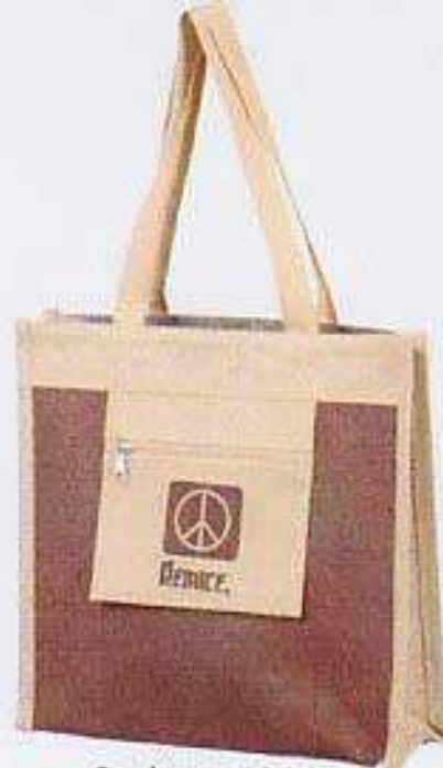
Style# 15200 Size: 13"x14"x5"