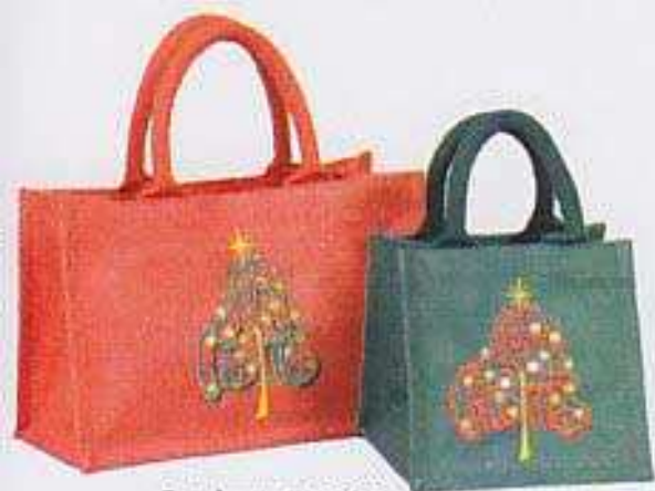
Style# 15208 Size: 8"x12"x5" & 6"x6"x6"