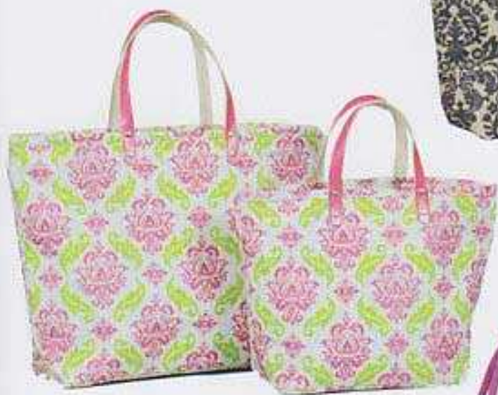
Style# 15126 Size: 14"x19"x5" & 11"x16"x5"