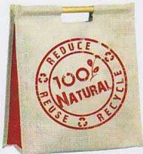
Style# 15016 Size: 16"x15"x6"