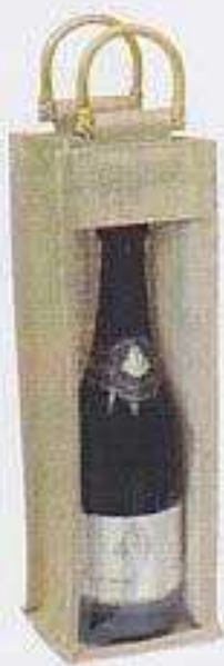
Style# 11005 Size: 14"x4"x4"