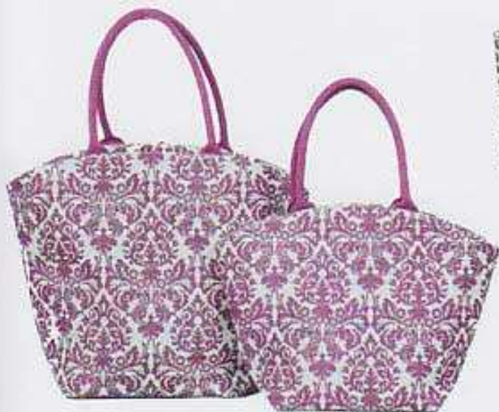
Style# 15085 Size: 15"x22"x6"D" & 12"x19"x5"D