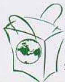
Style# 15005 Size: 15"x13"x5"