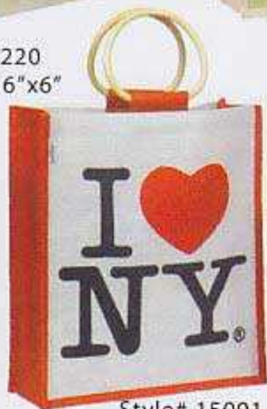
Style# 15001 Size: 15"x13"x5"