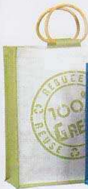
Style# 15001 Size: 17"x15"x6"