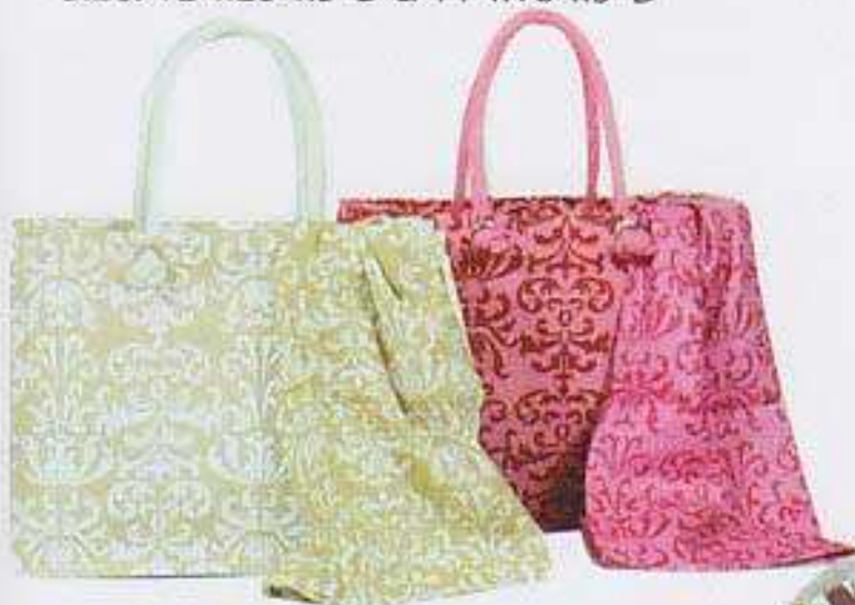
Style# 15083 Size: 13"x16"x6"