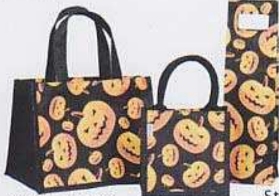
Style# 15220 Size: 9"x11"x8"