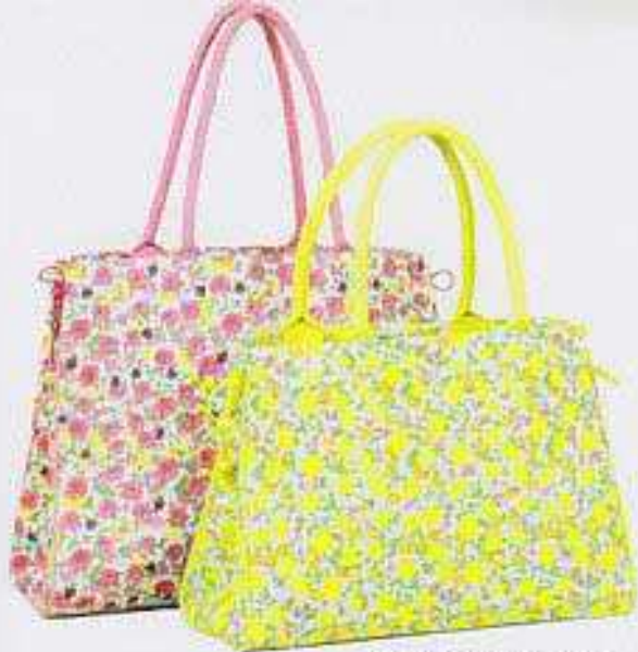
Style# 15087 Size: 14"x17"x6" & 11"x16"x5"