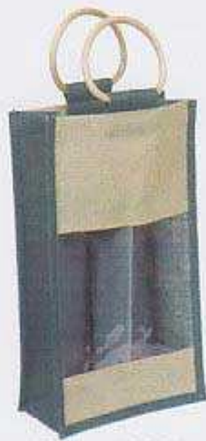
Style# 11024 Size: 14"x8"x4"