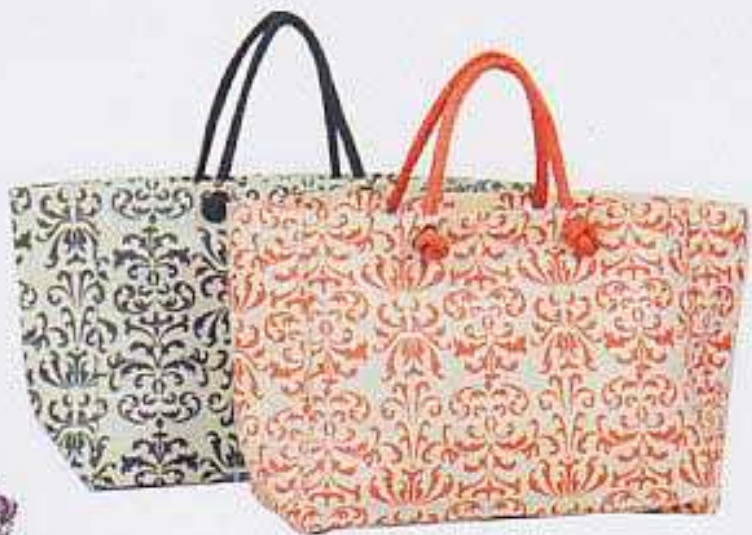
Style# 15234 Size: 14"x19"x6"