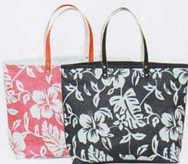
Style# 15126 Size: 13"x20"x6"D