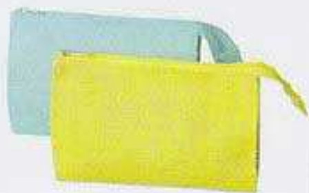
Style# 15183 Size: 6"x9"x3"