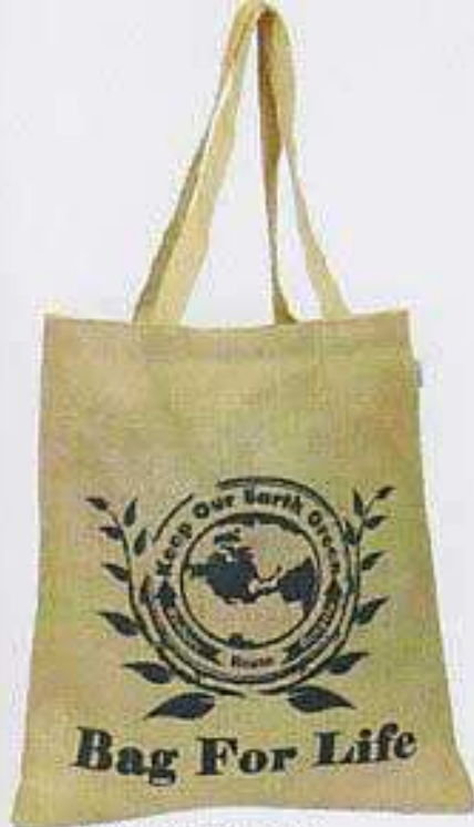
Style# 15137 Size: 15"X14"