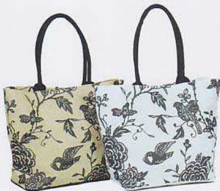
Style: 15302 Size: 13"x18"x6"D