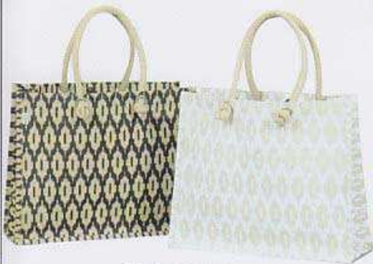
Style# 15083 Size: 13"x16"x6"