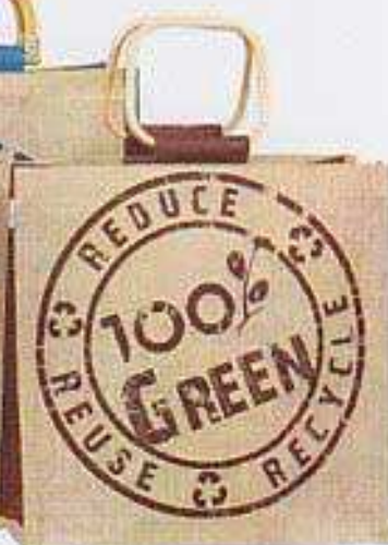
Style# 15005 Size: 12"x12"x5"