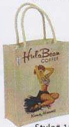
Style# 15197 Size: 10"x8"x4"