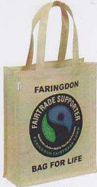
Style# 15220 Size: 15"X13"X5"