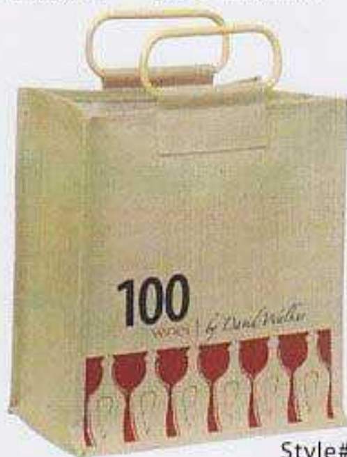
Style# 11012 Size: 14"x12"x8"