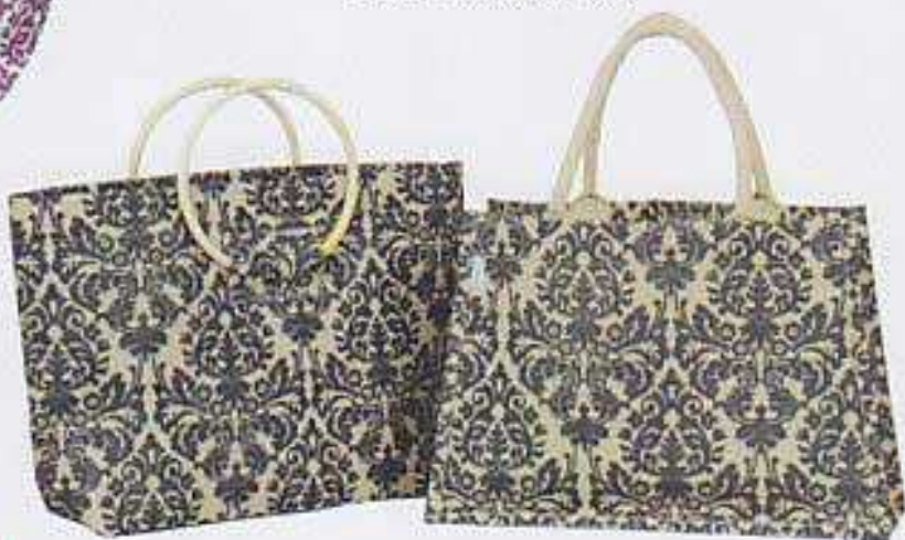
Style# 15310"D & 15208T" Size: 12"x19"x5" & 12"x16"x6"