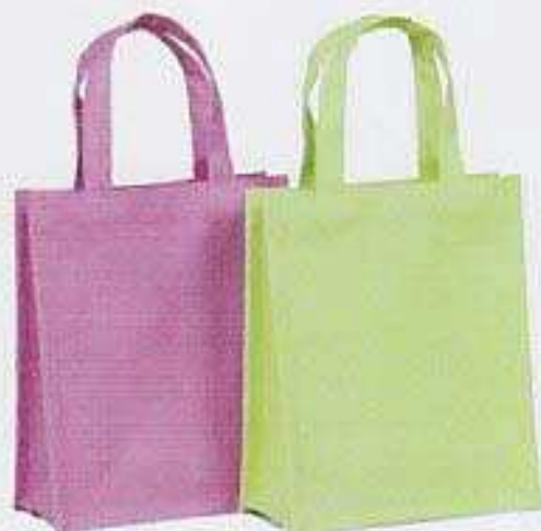
Style# 15220 Size: 10"x8"x4"