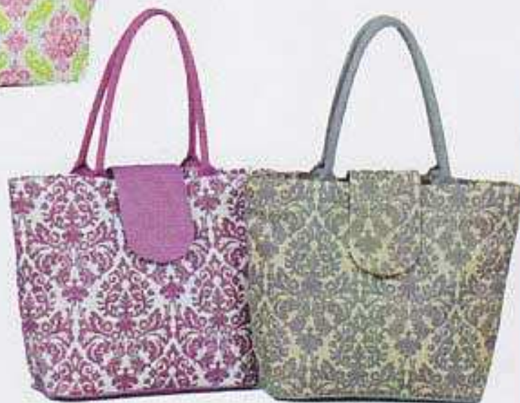
Style# 15300 Size: 13"x18"x6"D