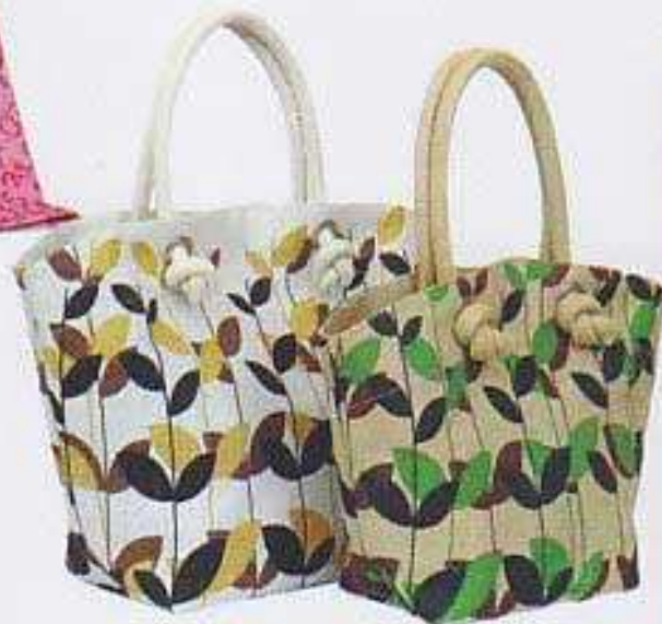
Style# 15110 Size: 13"x17"x6"D & 11"x15"x5"D