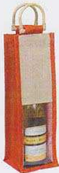
Style# 11004 Size: 14"x4"x4"