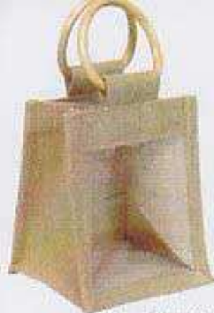
Style# 15187 Size: 6"x5"x4"