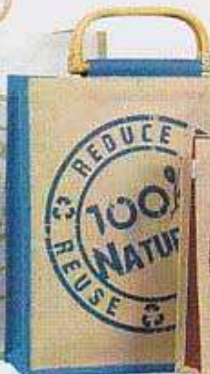
Style# 15002 Size: 15"x14"x5"