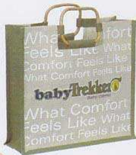
Style# 15037 Size: 14"X14"X6"