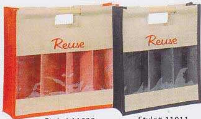
Style# 11022 Size: 14"x16"x4"